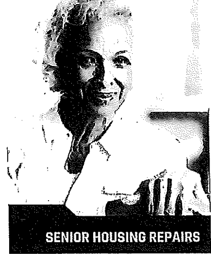
SENIOR HOUSING REPAIRS

The Adaptive Modifications Program provides free accessibility modifications to the house or apartment of a person with permanent physical disabilities. www.phdcphila.org (215) 448-2160